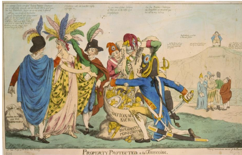
British satire of Franco-American relations after the XYZ Affair in May of 1798; 5 Frenchmen plunder female "America", while six figures representing other European countries look on. John Bull sits laughing on "Shakespeare's Cliff."